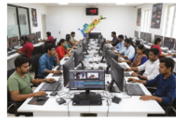
Data Visualization and Dashboard Development