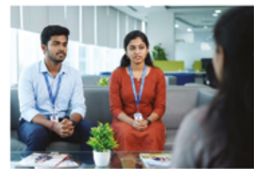
Predictive Analytics and Machine Learning Basics