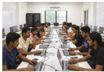
Statistical Analysis and Quantitative Techniques