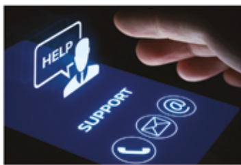
Database Management Systems & SQL