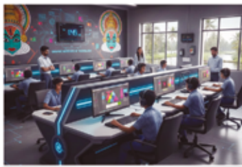
Fundamentals of Data Analytics & Business Intelligence

Graduates can explore roles such as data analyst, business intelligence executive, operations analyst, and market researcher. Opportunities exist in IT, finance, healthcare, retail, and consulting, both in India and abroad, with excellent career growth and competitive salaries.