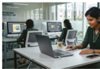
Business Analytics Tools (Excel, Power BI, Python)